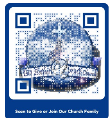
Scan to Give or Join Our Church Family

**VISITORS MAY REGISTER THEIR ATTENDANCE ONLINE ON THE BIG BETHEL GUEST REGISTRATION FORM. THANK YOU FOR WORSHIPPING WITH US AND FEEL FREE TO COME AGAIN!!!!